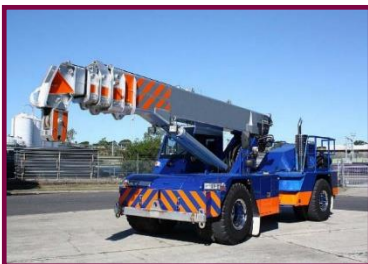
Excellent - Example #1