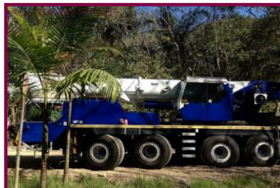
Poor - Example #2